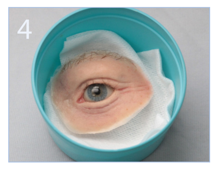
Store the prosthesis in the provided clean, dry container. Place the prosthesis in the container with the front side up. Doing this will help to keep the eyelashes in place.

The margins of the prosthesis are very thin (see photo). Careful attention must be made not to tear or damage this edge.